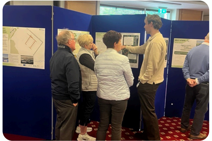
Image 2 and Image 3: The project design team with attendees at the public consultation event held at the Hodson Bay Hotel in April 2026.