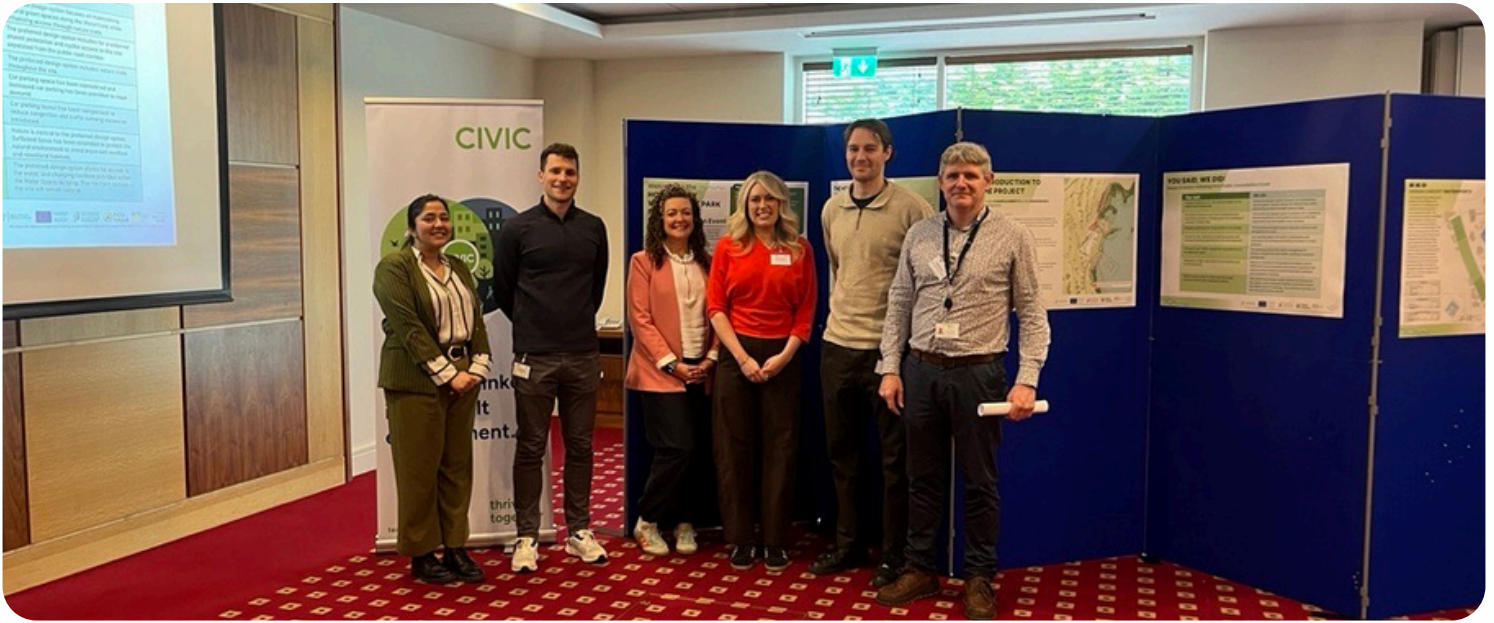
Image 1: Members of the Hodson Bay Waterfront Park design team at the Public Consultation in April 2026.