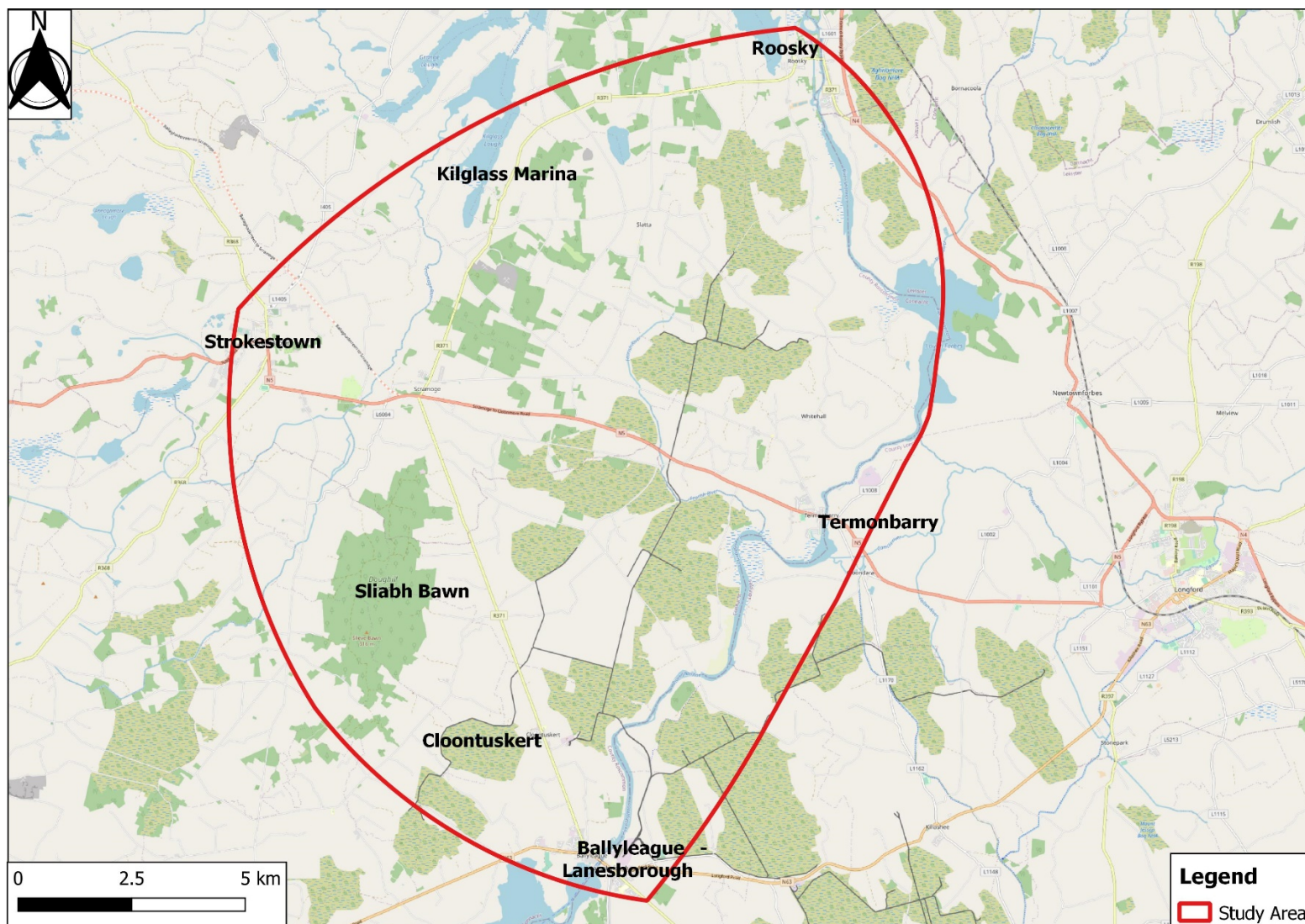
Study Area – Mid Shannon Greenway - Ballyleague/Lanesborough, Strokestown, Roosky & Termonbarry

Please complete the feedback form and return by email or post by 12th May 2023