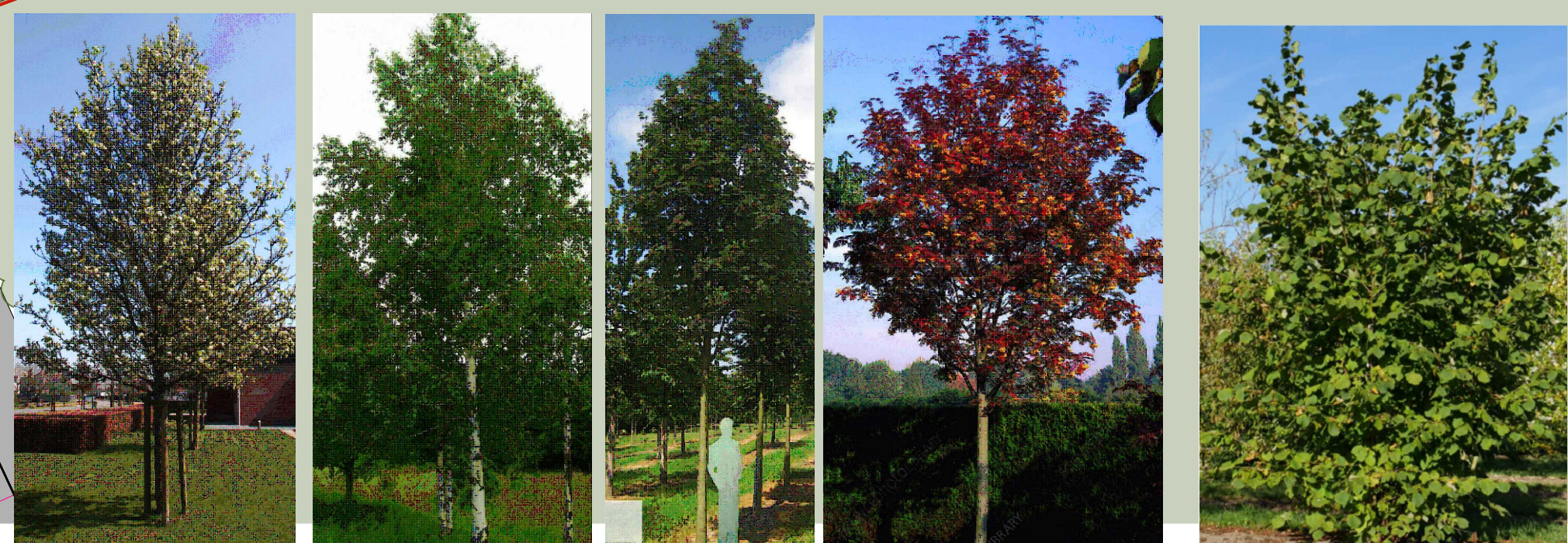
Pyrus calleryana 'Chanticleer' Betula pendula Sorbus 'Sheerwater Seedling' Sorbus 'Joseph Rock' Corylus avellana Hazel