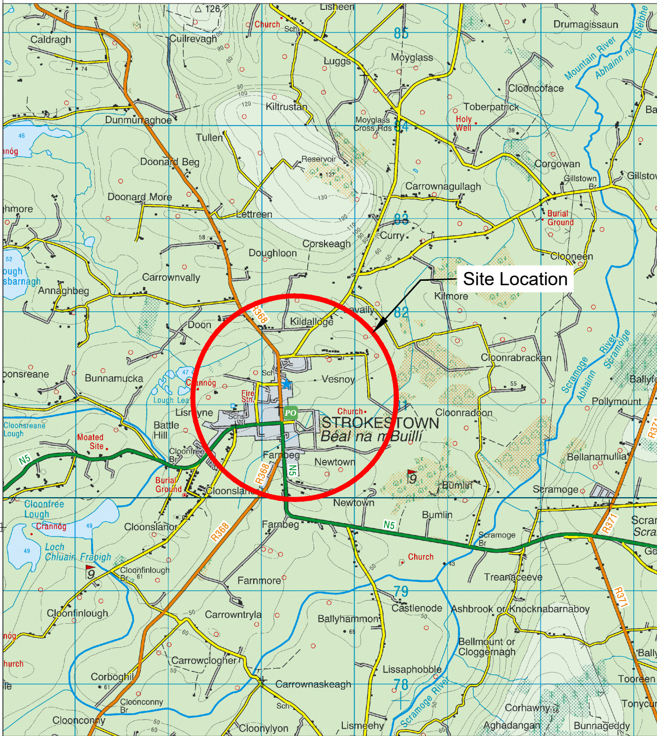
Site Location 1:20,000