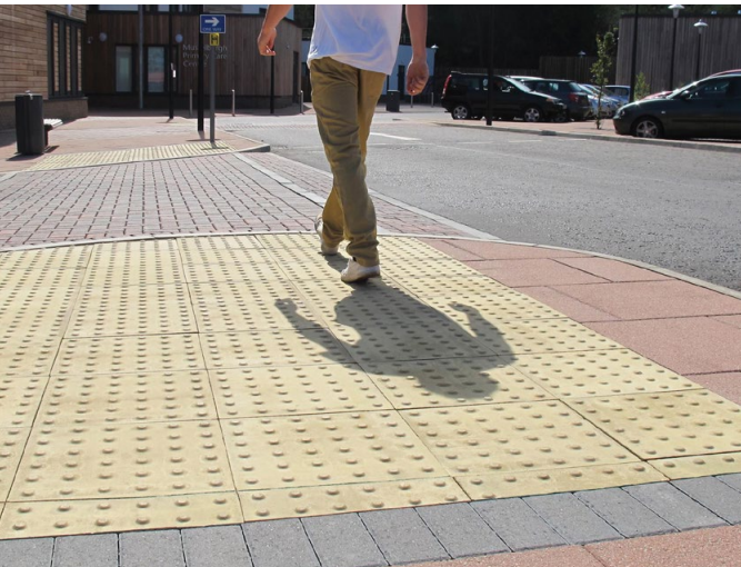
Example of blister paving demarcating uncontrolled crossing points throughout the scheme

The images shown are indicative and subject to detailed design