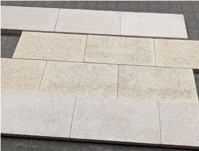
Example of high quality concrete / natural aggregate paving to footways (Image ref - Tobermore Braemar and Fusion)