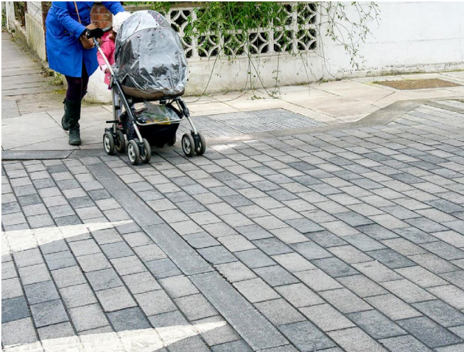
Example of concrete / natural aggregate sett surfacing used at crossing points (Image ref - Tobermore City pave VS5)