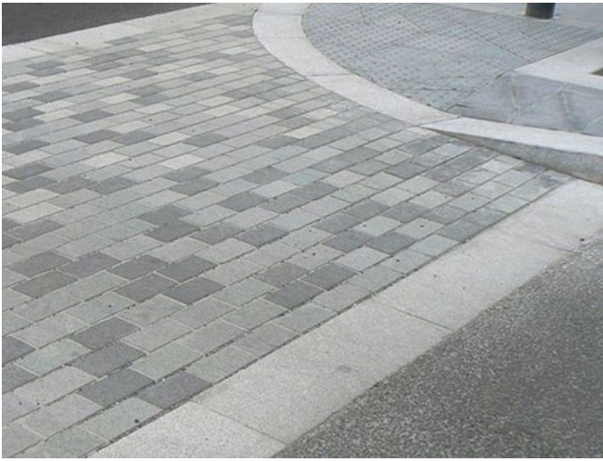
Example of concrete / natural aggregate flush kerb as used to crossings, entrances etc.