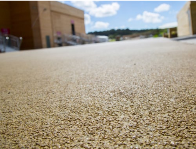
Example of coloured asphalt surfacing demaracting some uncontrolled crossings