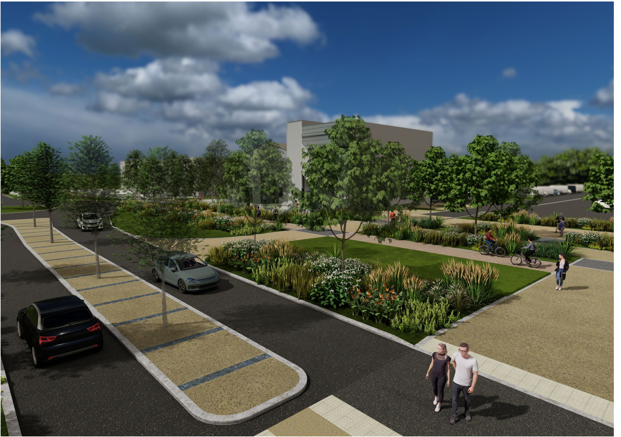
View of the proposed linear park looking north-east along N61/Circular Road

The design is based on the following aspirations: