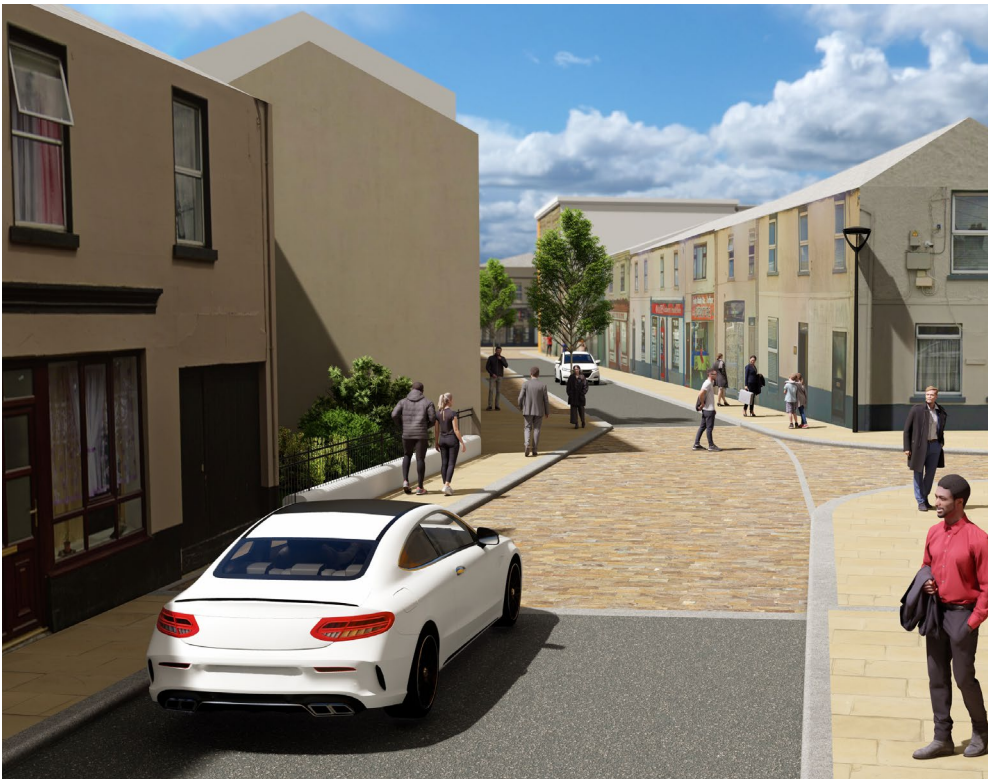
View looking east along Church Street towards Main Street indicating proposed public realm and street enhancements.