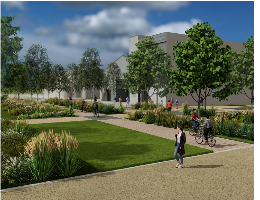
View looking north-east along the linear park towards the Roscommon Arts Centre