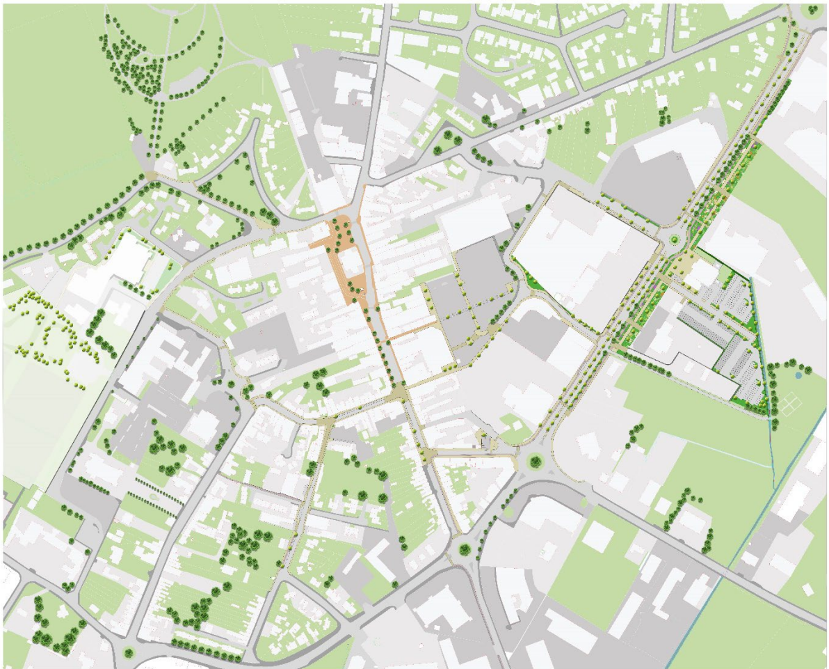
Overall Concept Masterplan for Roscommon

Project Ireland 2040 is the overarching policy and planning framework for the social, economic and cultural development of Ireland. It includes both the 20-year National Planning Framework (NPF) and a detailed capital investment plan for the period 2018 to 2027 called the National Development Plan (NDP) 2018-2027. The NPF outlines the broader policy principles and priorities to plan, in a more strategic, sustainable and coordinated manner, for future population and economic growth over the next 20 years.