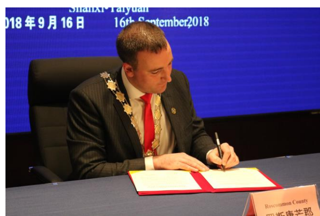
Signing Friendship MOU with Shanxi Province