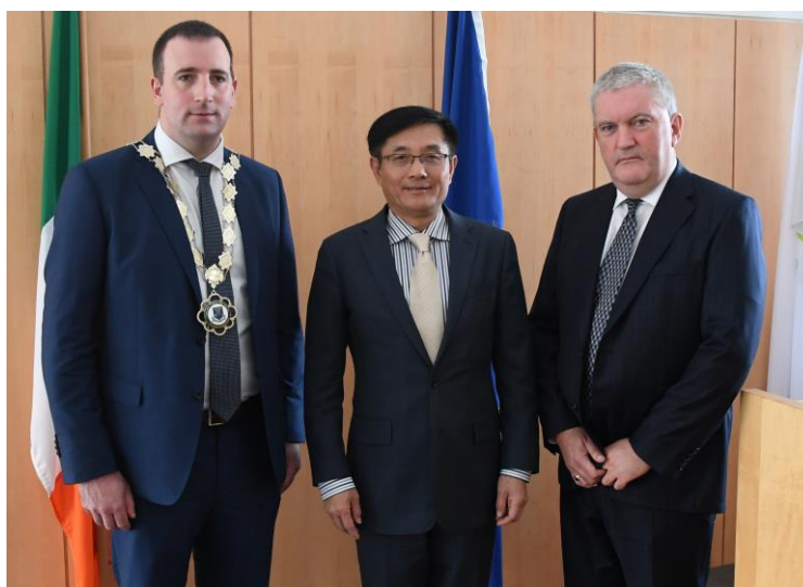
Chinese Ambassador to Ireland with Cathaoirleach and Chief Executive