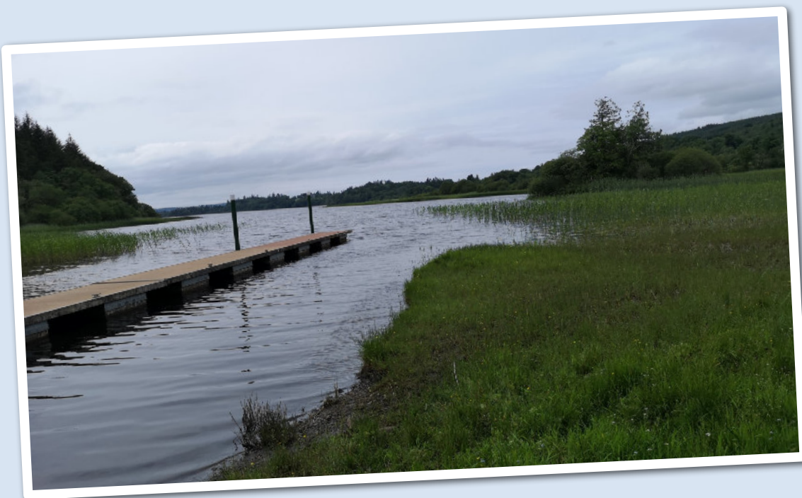
Lough Meelagh, Keadue, Co. Roscommon