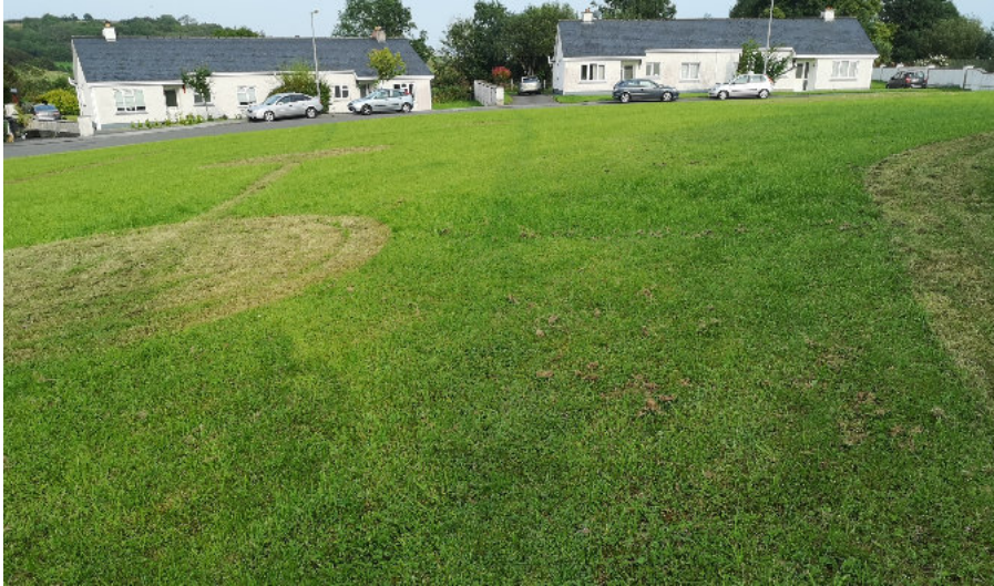
Area of grassland identified as a site for a wildflower meadow

This large area of grassland is currently managed as a lawn, resulting in minimal biodiversity value. A section of this green area, with consultation and input from local residents, should be managed to achieve a more diverse wildflower meadow. See the link in the resources table for further information on wildflower meadow creation and maintenance.