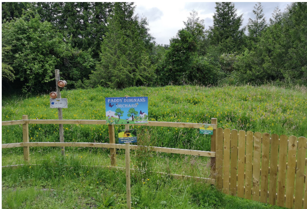
Paddy Duignan's Garden is already managed with biodiversity in mind