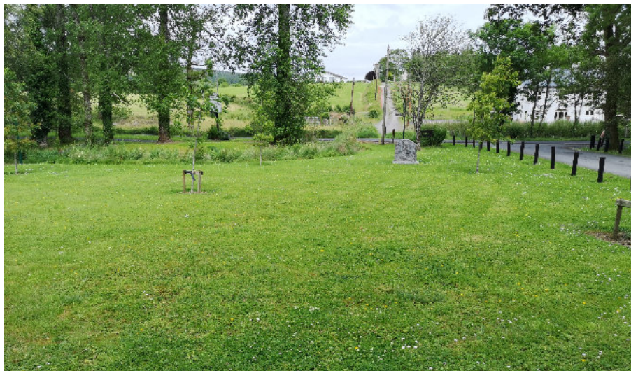
Area of grassland identified as a site for a wildflower meadow

An area of grassland by Knockranny Wood is currently maintained by regular mowing. The adoption of a suitable cutting regime could transform this area into a wildflower meadow, complimenting the biodiversity value of this area. As the sward contains some wildflower species already, an appropriate cutting regime, rather than removing the sod and re-seeding with wildflower seed, is preferable. See the link in the resources table for further information on wildflower meadow creation and maintenance.