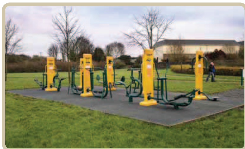
Outdoor Fitness Equipment at Loughnaneane Park, Roscommon

Roscommon County Council installed a range of outdoor fitness equipment in both the Pleasure Grounds, Boyle and Loughnaneane Park, Roscommon in November/December 2011. The equipment is designed to cater for the needs of adults, including older persons in order to promote health and improve fitness levels for the benefit of all users. There are seven different pieces of exercise equipment provided at both locations. The project was jointly funded by the local authority and the Department of Transport, Tourism and Sport with assistance provided through the National Lottery. The equipment is fully operational during the opening hours of both facilities.