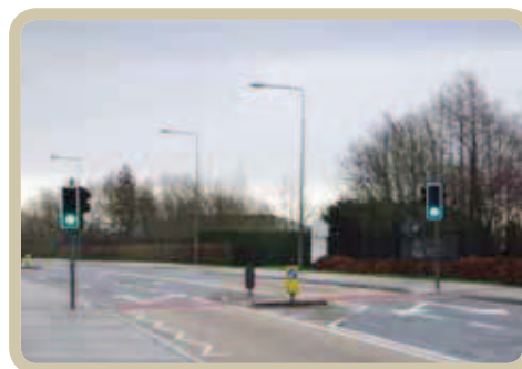
Pedestrian Crossing and other roadworks complete at Tuam Road, Monksland

Works funded under the Smarter Travel Initiative, 2011 included the provision of two no. controlled pedestrian crossings within the 50 Kph speed limit on Regional Road R362 known as the New Tuam Road in Monksland. The works supplement other improvement works carried out by the Council. The R362 is a significant regional road linking Athlone to Tuam and the West.