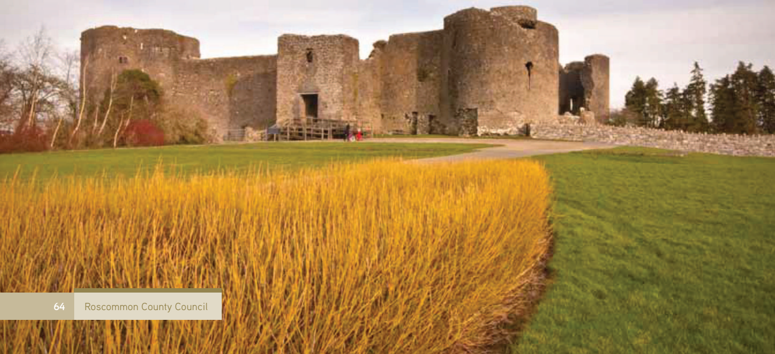
Roscommon Castle, Loughnaneane Park