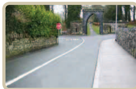
Footpaths completed at Abbeytown Road, Boyle on the approach to Rockingham

This project included the provision of 1.63 kilometers of footpaths and two no. pedestrian crossings on Abbeytown Road in Boyle. The works provide a new link between the Boyle Town centre and the widely renowned tourist attraction of Lough Key Forest Park. Pedestrian crossings were provided at appropriate locations including the entrances to existing schools.