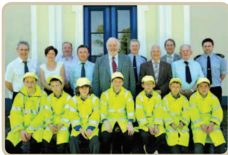
Junior School Warden Competition June 2011 - Pupils from St. Paul's National School, Castlerea attending the Regional Competition in Newtownforbes, Co. Longford.

All five schools participated in the Regional Competition which was held in Newtownforbes National School, Longford in June, 2011. Schools from Roscommon, Longford and Westmeath participated and the overall winners were the host team from Newtownforbes National School, Longford. The standard was particularly high in 2011 and the Judging Committee had great difficulty in selecting the overall winners of the competition.