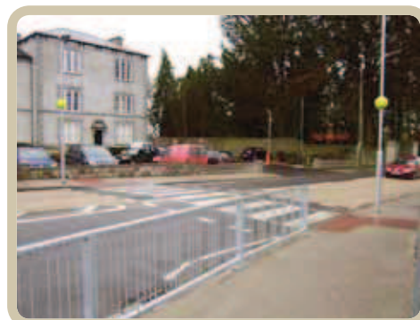
Pedestrian Crossing at Library/Roscommon CBS in Abbeytown, Roscommon Town.

This scheme involves the provision of a new pedestrian crossing on the N63 National Secondary route outside the Abbey Boys National School on Circular Road. The works also include the provision of a traffic-calming centre island and railings to encourage safe road crossing for school goers. Roscommon County Council also installed a new pedestrian crossing with railings in Abbeytown to facilitate students of the local secondary school, users of the library and the wider public.