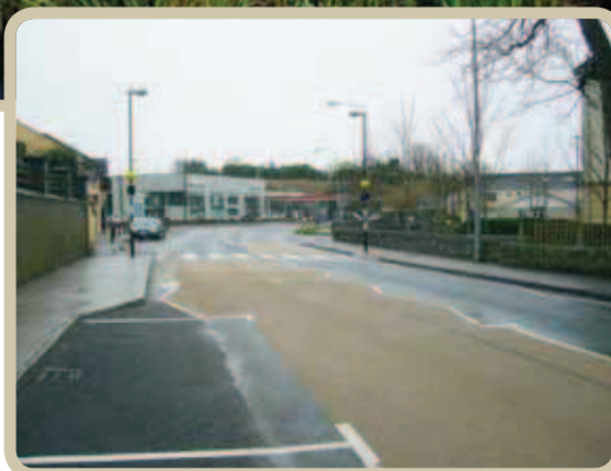
Works completed at Cortober including footpaths and pedestrian crossing

This scheme provides for the provision of 185 metres of footpaths on the westbound side of the newly constructed bridge linking Cortober and Carrick-on-Shannon and the junction between the N4 Sligo Road and Regional Road R368. The works also involve the provision of two no. controlled pedestrian crossings. The conversion of Liberty Hill to a one way traffic system was also incorporated into the scheme.