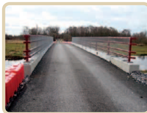
Erragh Bridge, Termonbarry

The original two-span bridge over the River Feorish on Local Road 6076 at Erragh, west of Termonbarry was demolished and replaced with a single span concrete structure. Works included the construction of new pile-supported abutments, embankment stabilisation and approach road strengthening works. Works were completed in 2010.