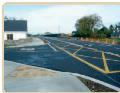
Regional Road 362, Tuam Road, Monksland, Athlone

Improvement works began on a 1.8 km section of the New Tuam Road and a 0.2 km section of the Old Tuam Road in Monksland. The works included the construction of a new roundabout at the intersection of the Old Tuam Road and the New Tuam Road, provision of public lighting, surface water drainage, undergrounding of services, a combined footway/cycleway, a pedestrian footway on the Old Tuam Road, road resurfacing, pedestrian crossings, bus bay and traffic calming measures. Works were nearing completion at the year end.