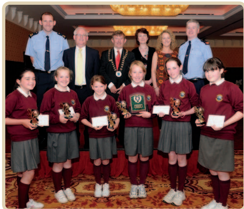
Junior Warden Competition Winners 2010 from Convent of Mercy National School, Boyle

Roscommon County Council hosted the annual Regional Competition for Junior School Wardens in the Convent of Mercy National School, Boyle in June, 2010. Schools from Roscommon, Longford and Westmeath participated and the overall winners were the host team from Boyle. The standard was particularly high in 2010.