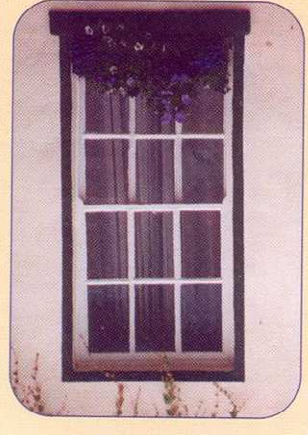
- Cootehall - BYNE MINDOMS SIX-OVER-SIX

the 19th century. 18th and through most of widely used during the glazing sub-division was of window size and This classic proportion