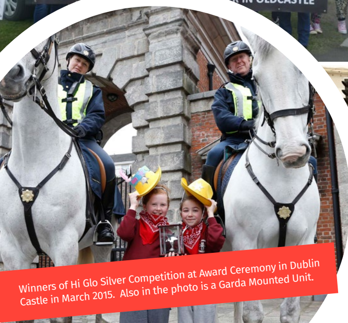
Winners of Hi Glo Silver Competition at Award Ceremony in Dublin Castle in March 2015. Also in the photo is a Garda Mounted Unit.