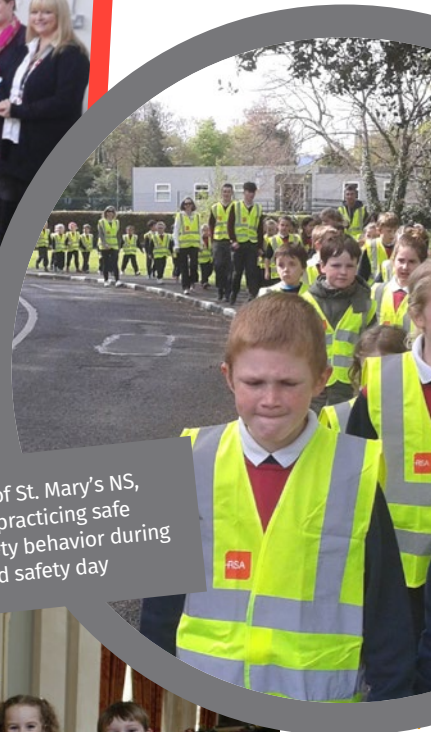
Children of St. Mary's NS, Belmont practicing safe road safety behavior during their road safety day