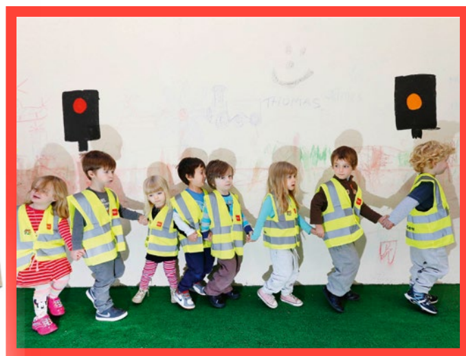
Pre school children practising road safety skills on Beep Beep Day.