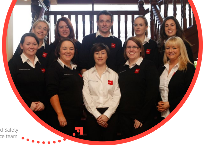
Nationwide Road Safety Education Service team