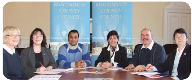
Meeting of Equality & Diversity Action Team.

The Equality Officer of Roscommon County Council is supported by the LGMSB and benefits from the Board's experience and expertise. The Equality Officer is also part of the Western/Northern Regional Equality Officers' Network which meets regularly and provides a forum for discussing equality issues. A representative from the LGMSB attends each meeting.