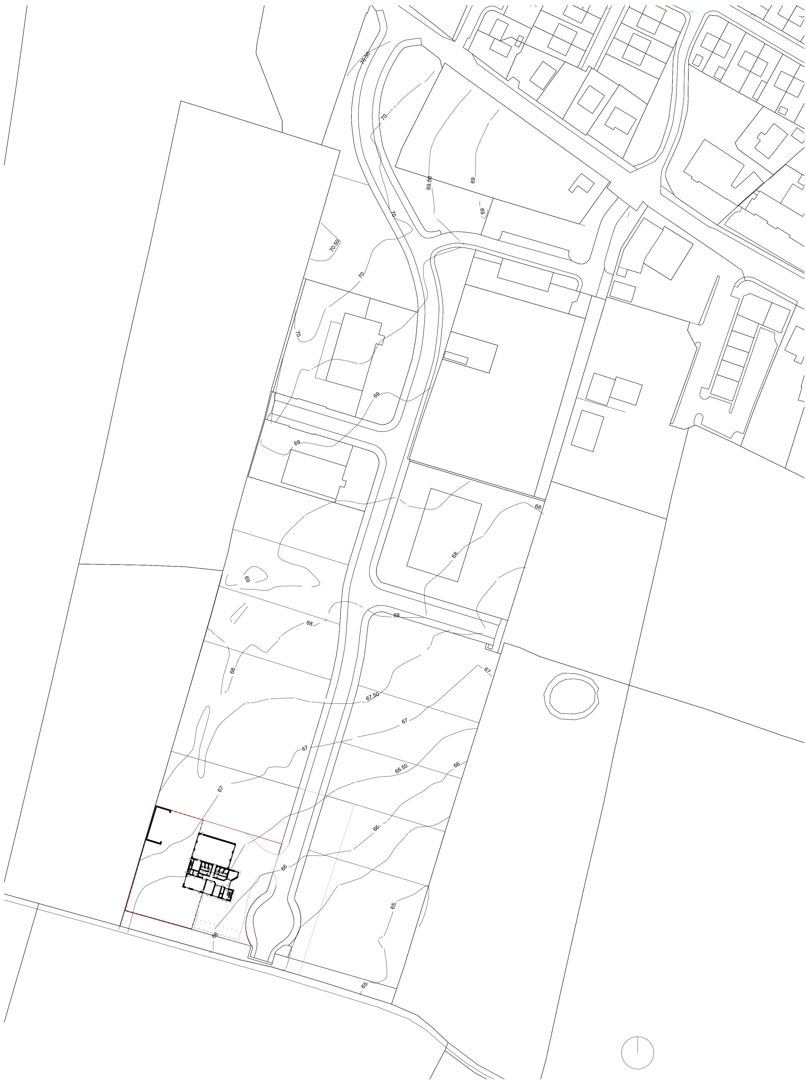
SITE PLAN 1:1000